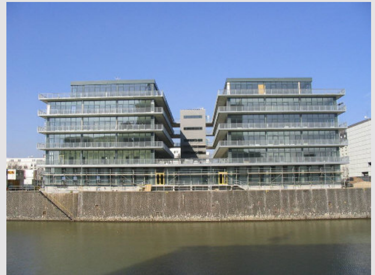
DE-CIX Competence Center @ Kontorhaus Building Frankfurt Osthafen (Docklands)